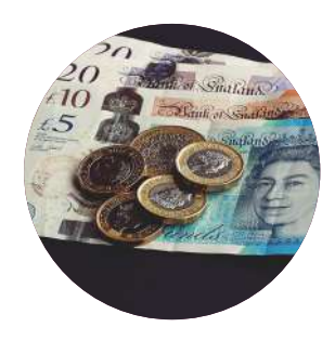
RECEIVE GREAT RETURNS